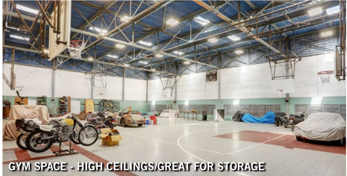
GYM SPACE - HIGH CEILINGS/GREAT FOR STORAGE